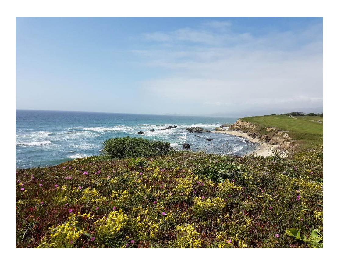
Half Moon Bay west of Palo Alto