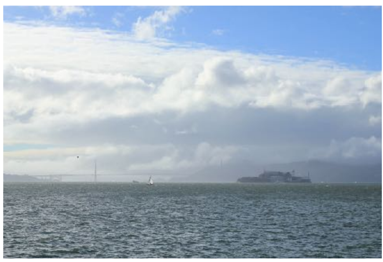
Alcatraz and the golden gate bridge seen from treasure island