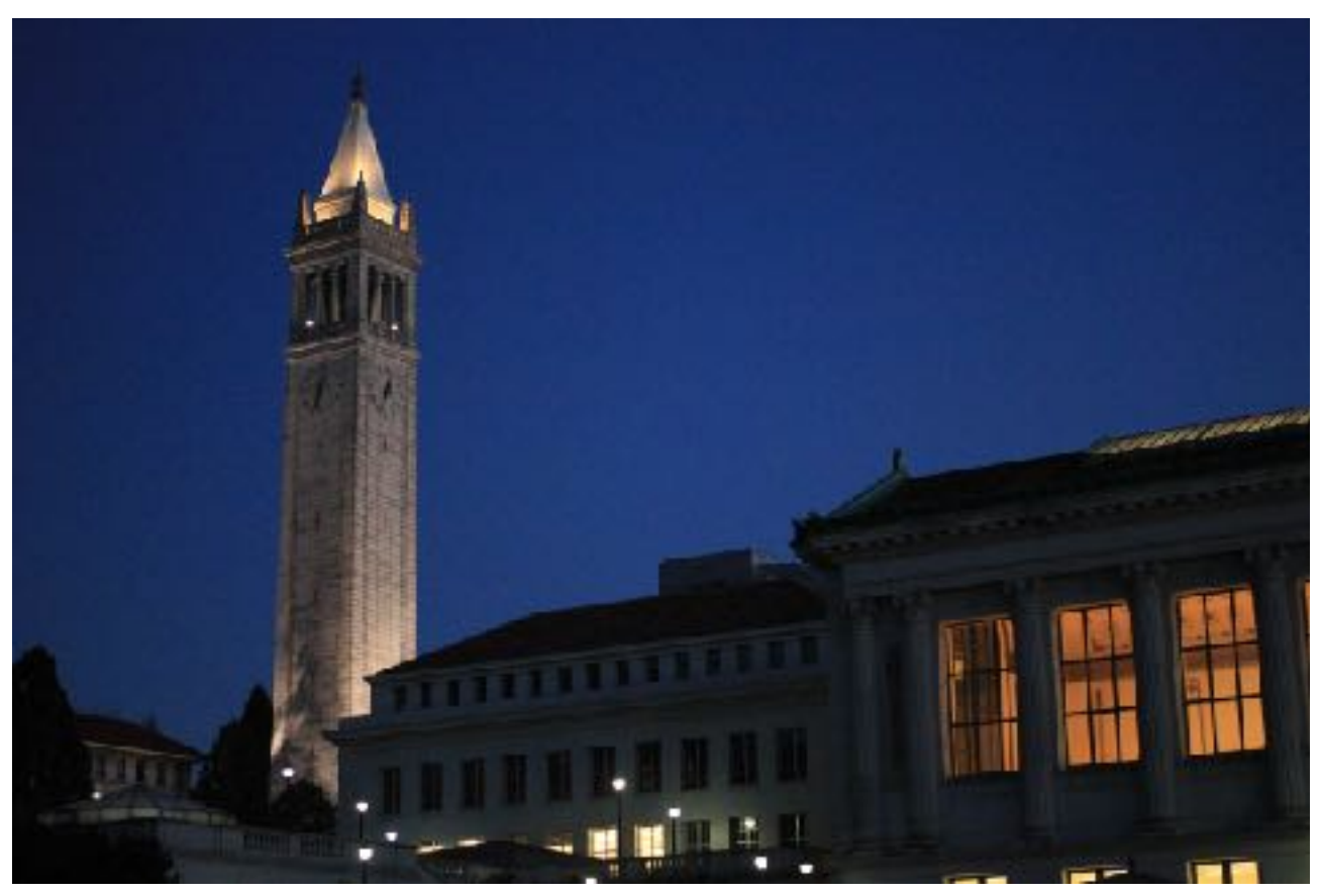
The campanile and Doe library on the UC Berkeley campus