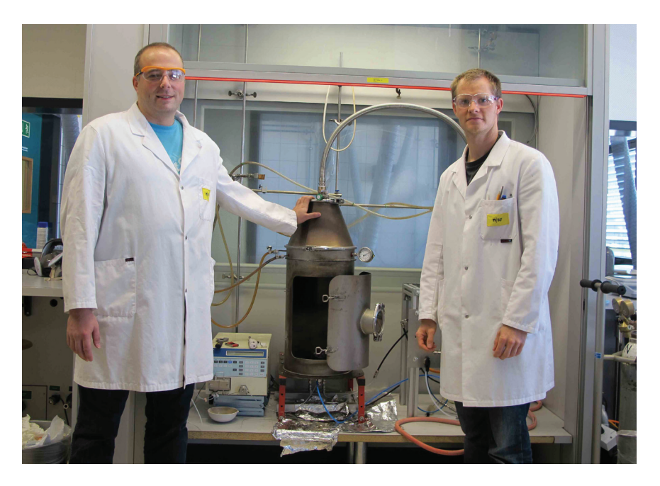
Co-workers of the SNI team working with the burner.

The SNI team investigated flame spray pyrolysis as a possible method for the production of manganese oxide nanoparticles. During flame spray pyrolysis the base substance (Manganese-Nitrate-Tetrahydrate) is dissolved in a flammable liquid (ethanol) and sprayed into a flame with high gas pressure. Thereby, tiny droplets of the solution are formed like in a fog. The base substance is oxidized and agglomerates of the nanoparticles are formed. The team of researchers first optimized the concentration of the base substance and gas flow as well as the